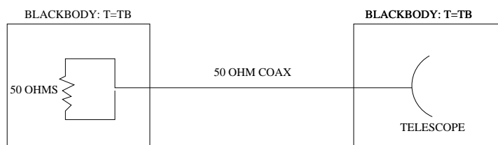
Fig. 2.— A perfectly matched telescope and load, each in its own blackbody cavity; the cavities are at the same temperature.

measure it with the same units as the celestial radiation, namely temperature. So we specify the receiver noise as the receiver temperature , denoted by the symbol T_R . Just as for any thermal noise source, the noise power is P = kT\Delta\nu (see § 7).